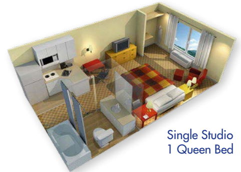
Single Studio 1 Queen Bed