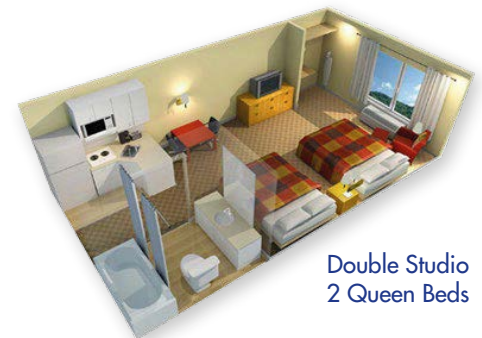
Double Studio 2 Queen Beds