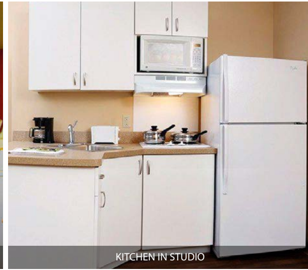
KITCHEN IN STUDIO