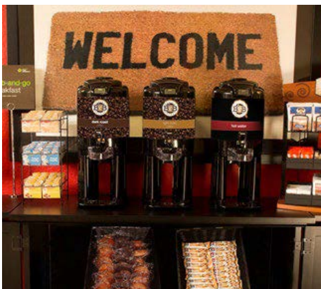
GRAB & GO BREAKFAST