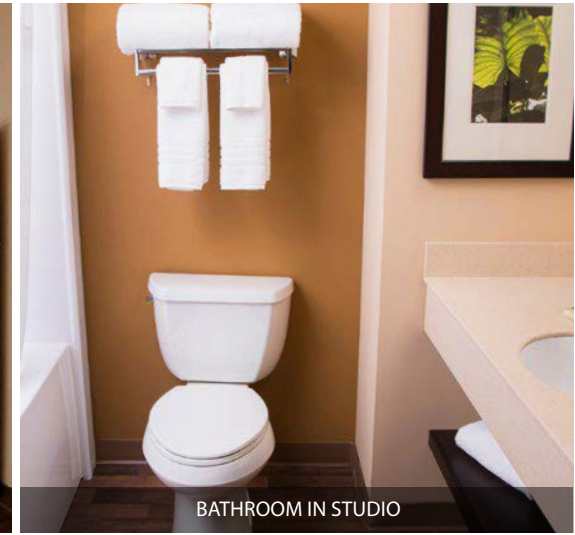
BATHROOM IN STUDIO