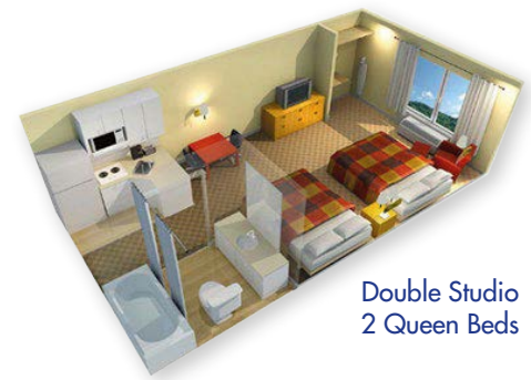
Double Studio 2 Queen Beds