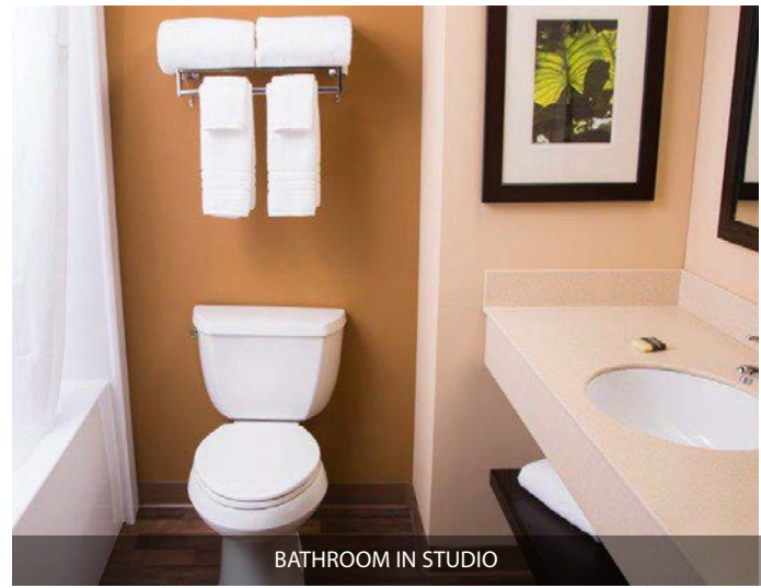
BATHROOM IN STUDIO