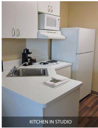
KITCHEN IN STUDIO