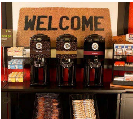
GRAB & GO BREAKFAST