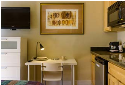
DELUXE SHARED ROOM KITCHENETTE