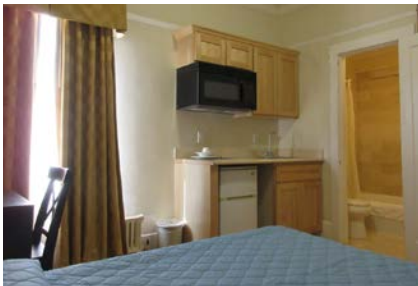
DELUXE PRIVATE SINGLE ROOM