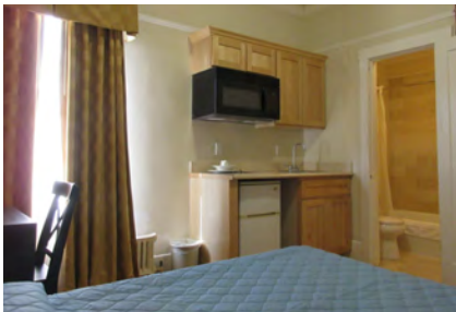
DELUXE PRIVATE SINGLE ROOM