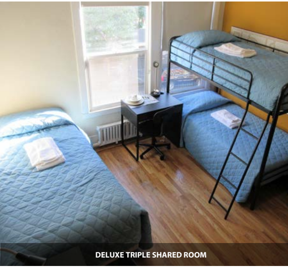
DELUXE TRIPLE SHARED ROOM