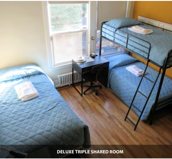
DELUXE TRIPLE SHARED ROOM