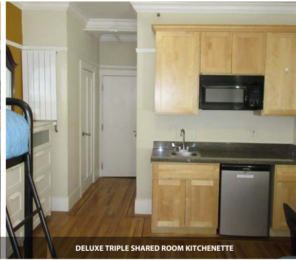
DELUXE TRIPLE SHARED ROOM KITCHENETTE