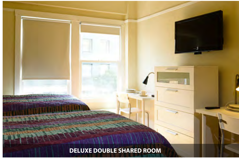
DELUXE DOUBLE SHARED ROOM