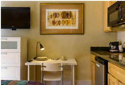
DELUXE SHARED ROOM KITCHENETTE