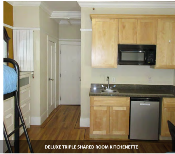
DELUXE TRIPLE SHARED ROOM KITCHENETTE