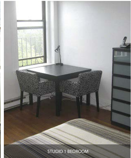
STUDIO 1 BEDROOM