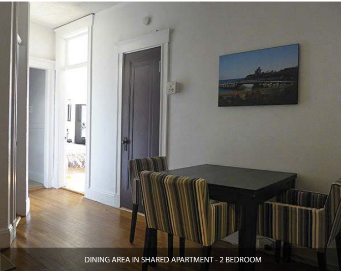
DINING AREA IN SHARED APARTMENT - 2 BEDROOM