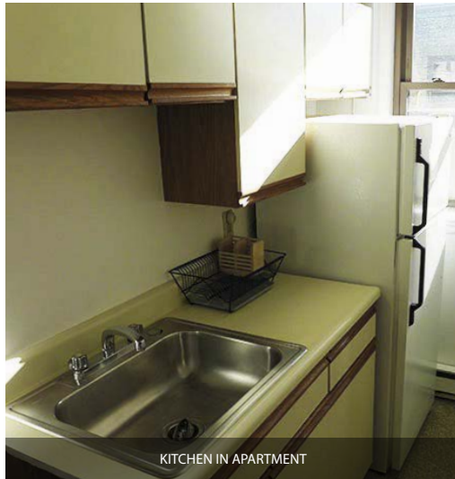
KITCHEN IN APARTMENT